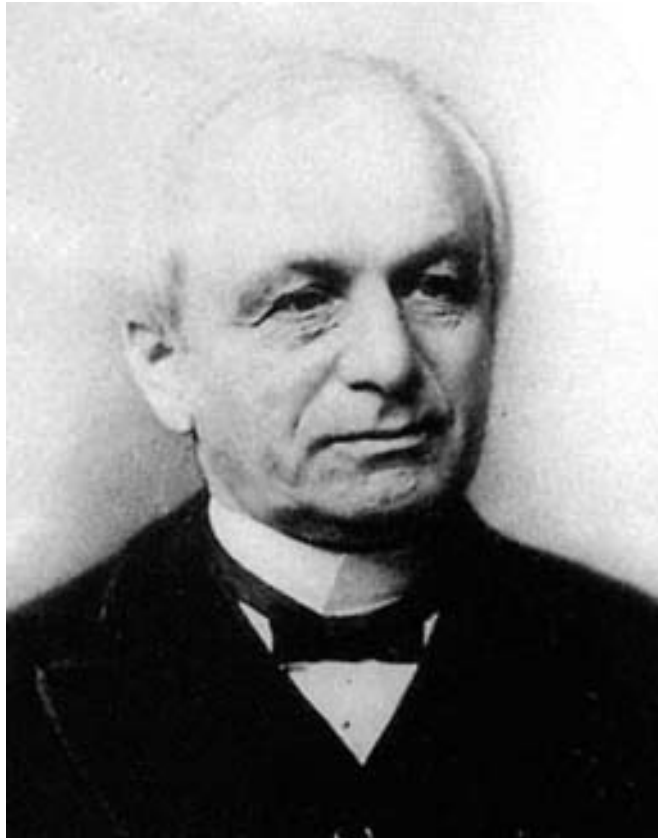
Leopold Kronecker (1823-1891)

God made the integers, all else is the work of man.