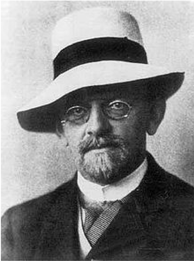
David Hilbert (1862-1943)

Cantor had influential admirers too, among them David Hilbert, who set the course of much of 20th Century mathematics in his address to the International Congress of Mathematicians in Paris in 1900.